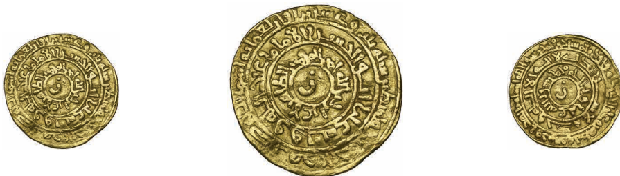
94 FATIMID, AL-ZAHIR (411-427h) Dinar, Filastin 423h Obverse and reverse: letter zayn in centres Weight: 4.09g Reference: Nicol 1503

This appears to be an unrecorded date for the rare mint of Tabariya (present-day Tiberias in Palestine).