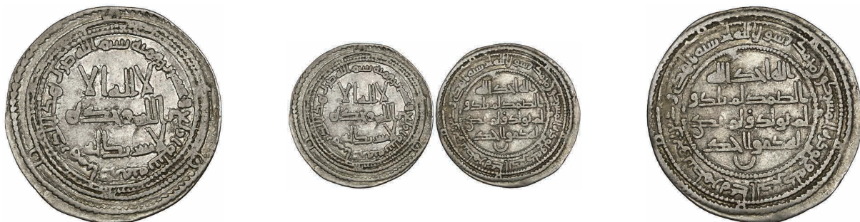
12 UMAYYAD, TEMP. HISHAM (105-126h) Dirham, Ifriqiya 124h Reverse: crescent below field Weight: 2.80g Reference: Klat 108.b (two examples listed)