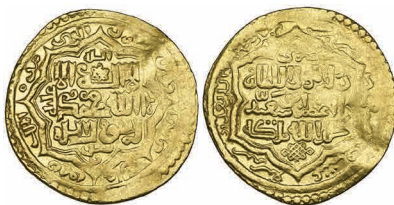
125 ILKHANID, ABU SA 'ID (716-736h) Dinar, Madinat al-Salam Baghdad 717h Weight: 5.66g Reference: Diler 478

Wavy flan and unevenly struck, very fine to good very fine and rare