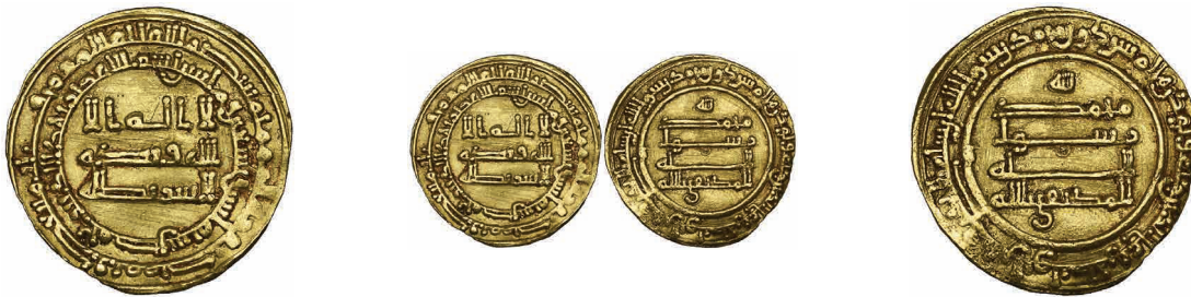
34 ABBASID, AL-MUKTAFI (289-295h) Dinar, Hims 292h Weight: 4.38g Reference: cf Bernardi 226Gd (date not listed)

Pin-marks in fields, otherwise better than very fine and of the highest rarity, apparently unpublished