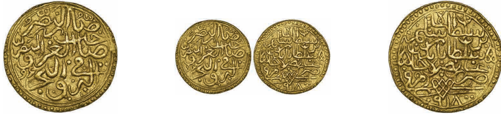
113 OTTOMAN, SELIM I (918-926h) Sultani, al-Ruha 918h Weight: 3.46g Reference: cf Pere 120

One of the classic rarities of the series, this is an example of the earliest Ottoman gold coin struck.