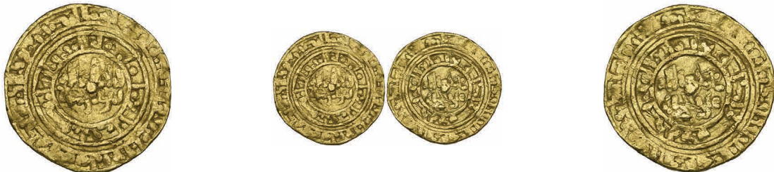
93 FATIMID, AL-HAKIM (386-411h) Dinar, Tabariya 394h Weight: 3.97g Reference: cf Nicol 1015 [395h]

This very rare issue, produced only in the first two years of al-Hakim's reign, features four-line inscriptions in the fields on both sides as opposed to the standard two-line legends found on most of al-Hakim's coinage. Only a handful of dinars of this type are recorded, of which this is the rarer, later year.