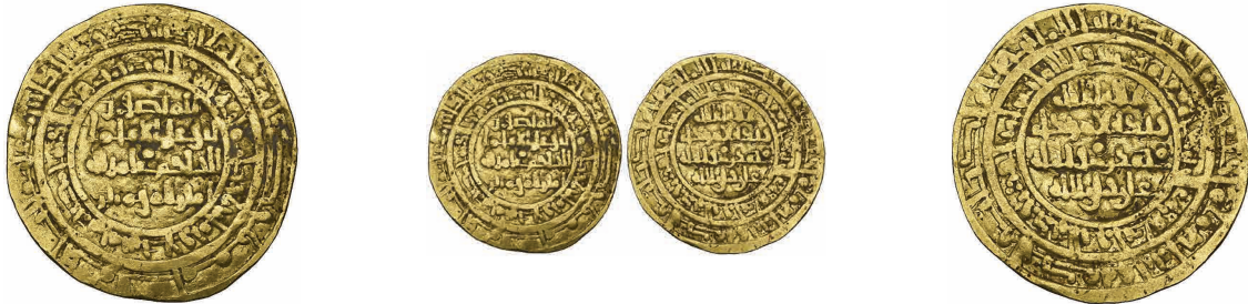
92 FATIMID, AL-HAKIM (386-411h) Dinar, Misr 387h Obverse: In field: al-Mansur | abu 'Ali al-Imam | al-Hakim bi-amr Allah | amir al-mu'minin Reverse: In field: la ilaha illa Allah | wahdahu la sharik lahu | Muhammad rasul Allah | 'Ali wali Allah Weight: 4.13g Reference: Nicol 1072, citing two examples

Good fine, an evenly-struck example of this extremely rare type