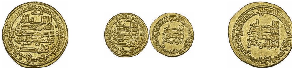
51 UMAYYAD OF SPAIN, 'ABD AL-RAHMAN III (300-350h) Dinar, al-Andalus 321h Weight: 4.10g Reference: CUS 201

This is the earliest date for gold dinars issued by the Umayyads of Spain.