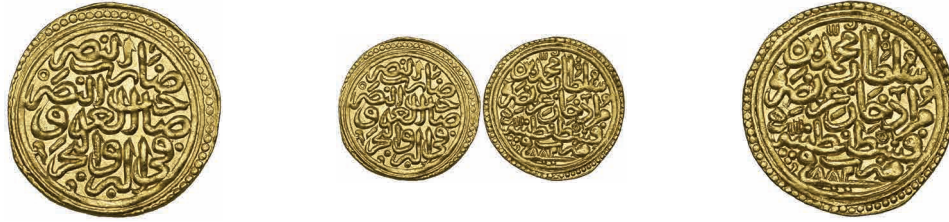
112 OTTOMAN, MEHMED II (SECOND REIGN, 855-886h) Sultani, Qustantaniya 882h Weight: 3.54g Reference: Pere 79

Extremely fine with some lustre and very rare