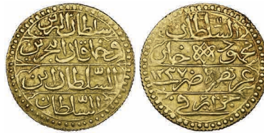
114 OTTOMAN, MAHMUD II (1223-1255h) Sultani, Jaza'ir 1237h Weight: 3.21g References: Pere 739; Artuk 1981; KM 66