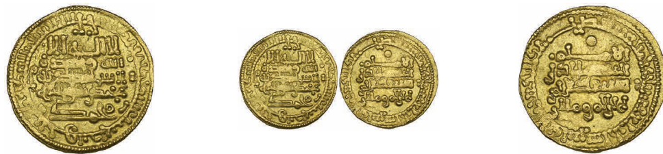
52 UMAYYAD OF SPAIN, 'ABD AL-RAHMAN III (300-350h) Dinar, al-Andalus 324h Obverse: citing Muhammad below Weight: 4.10g Reference: cf CUS 200, for a coin with similar legends dated 321h

Almost extremely fine and extremely rare