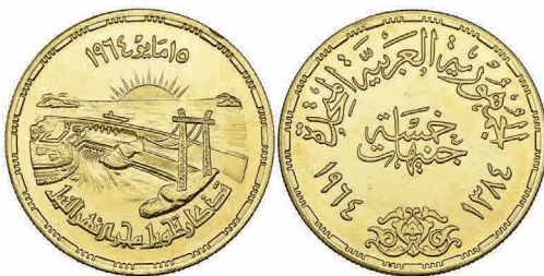
106 EGYPT, UNITED ARAB REPUBLIC (AD 1958-1971) Gold five-pounds, 1384h (AD 1964) Obverse: representation of the Diversion of the Nile Weight: 25.97g Reference: KM 408