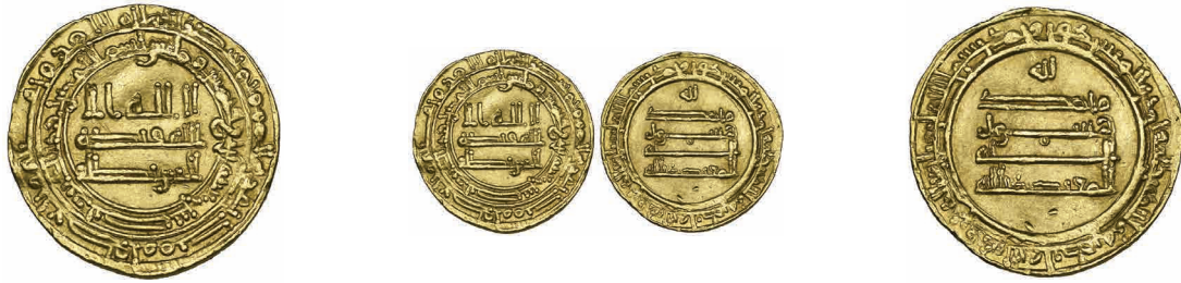
33 ABBASID, AL-MU'TADID (279-289h) Dinar, Nisibin 284h Weight: 4.76g References: Bernardi 211Hg

Light crease, good very fine and extremely rare