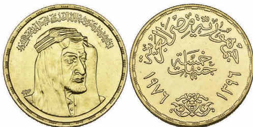
107 EGYPT, ARAB REPUBLIC (AD 1971-) Gold five-pounds, 1396h (AD 1976) Obverse: Bust of King Faisal of Saudi Arabia three-quarters right Weight: 25.97g Reference: KM 459