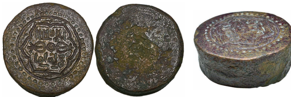
126 CHAGHATAYID, TEMP. TARMASHRIN (726-734h) Bronze obverse die for anonymous silver dinars, type of Bukhara, c. 728-730h In field: al-'adl wa'l-mulk | tamgha | tu'aman (see note)

Weight: 135g Diameter: 38mm Thickness: 14.8mm Reference: cf Album 1992 for coins produced from dies of this type