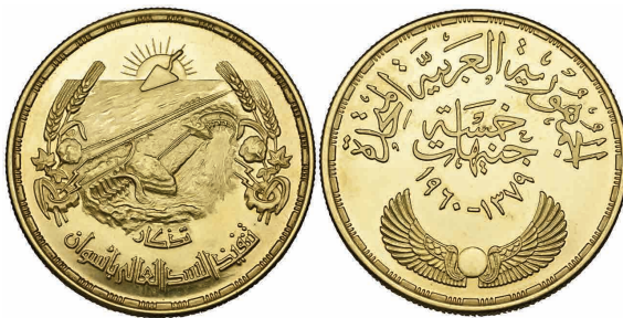
105 EGYPT, UNITED ARAB REPUBLIC (AD 1958-1971) Gold five-pounds, 1379h (AD 1960) Obverse: Aswan Dam Weight: 42.61g Reference: KM 402

Ex Sotheby's, 28 April 1982, lot 412 (offered with envelope)