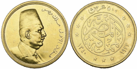
103 EGYPT, FUAD I (AD 1922-1952) Gold 500-piastres, 1340h (AD 1922) Weight: 42.65g Reference: KM 342

Almost uncirculated and rare [1,800 struck]