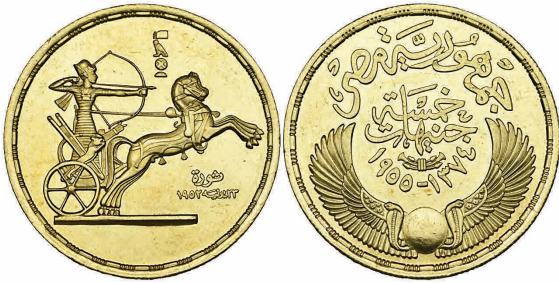
104 EGYPT, REPUBLIC (AD 1953-1958) Gold five-pounds, 1374h (AD 1955) Obverse: Ancient Egyptian charioteer riding to right, holding drawn bow Weight: 42.65g Reference: KM 388

Struck in yellow gold, minor hairlines otherwise almost as issued