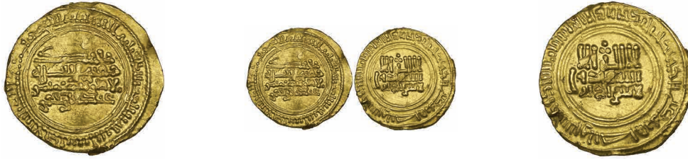
50 UMAYYAD OF SPAIN, 'ABD AL-RAHMAN III (300-350h) Dinar, al-Andalus 317h Weight: 3.98g Reference: CUS 187

Edge marks (probably where removed from a claw-mount), slightly creased and some other minor marks, otherwise good very fine and extremely rare £2,000-3,000