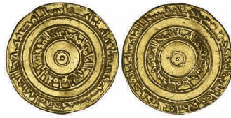
91 FATIMID, AL-'AZIZ (365-386h) Dinar, Filastin 380h Weight: 4.16g Reference: Nicol 680