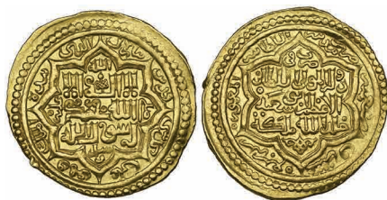
124 ILKHANID, ABU SA 'ID (716-736h) Dinar, Madinat al-Sultaniya al-Ma'mura 717h Weight: 8.05g Reference: Diler 478