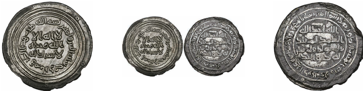
11 UMAYYAD, TEMP. 'ABD AL-MALIK B. MARWAN (65-86h) Dirham, Ard 82h Weight: 2.00g References: Klat 30 (two examples listed); ANS 1977.235.25, same dies

Reverse stained and some edge losses but the obverse very clear, good very fine/fine and extremely rare £4,000-6,000