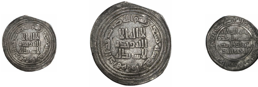
10 UMAYYAD, TEMP. AL-WALID I (86-96h) Dirham, Arran 90h Weight: 1.96g Reference: Klat 27 (three examples listed)

Clipped, fine to good fine and very rare